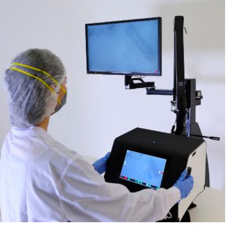
After positioning the ML-Pro Crime Lite<sup>®</sup>, the Elite 5216 arm's internal gas springs allow the user to keep the device level and stable, despite its bulk.

The complete Foster + Freeman ML-Pro Crime Lite<sup>®</sup> station.